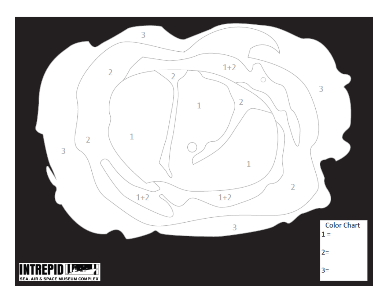
Southern Ring Nebula

Use coloring pencils to color in the planetary nebulae below or print these sheets on watercolor paper and use watercolor paints to color them in. Decide which color you want to associate with each number and color in the space according to each number.