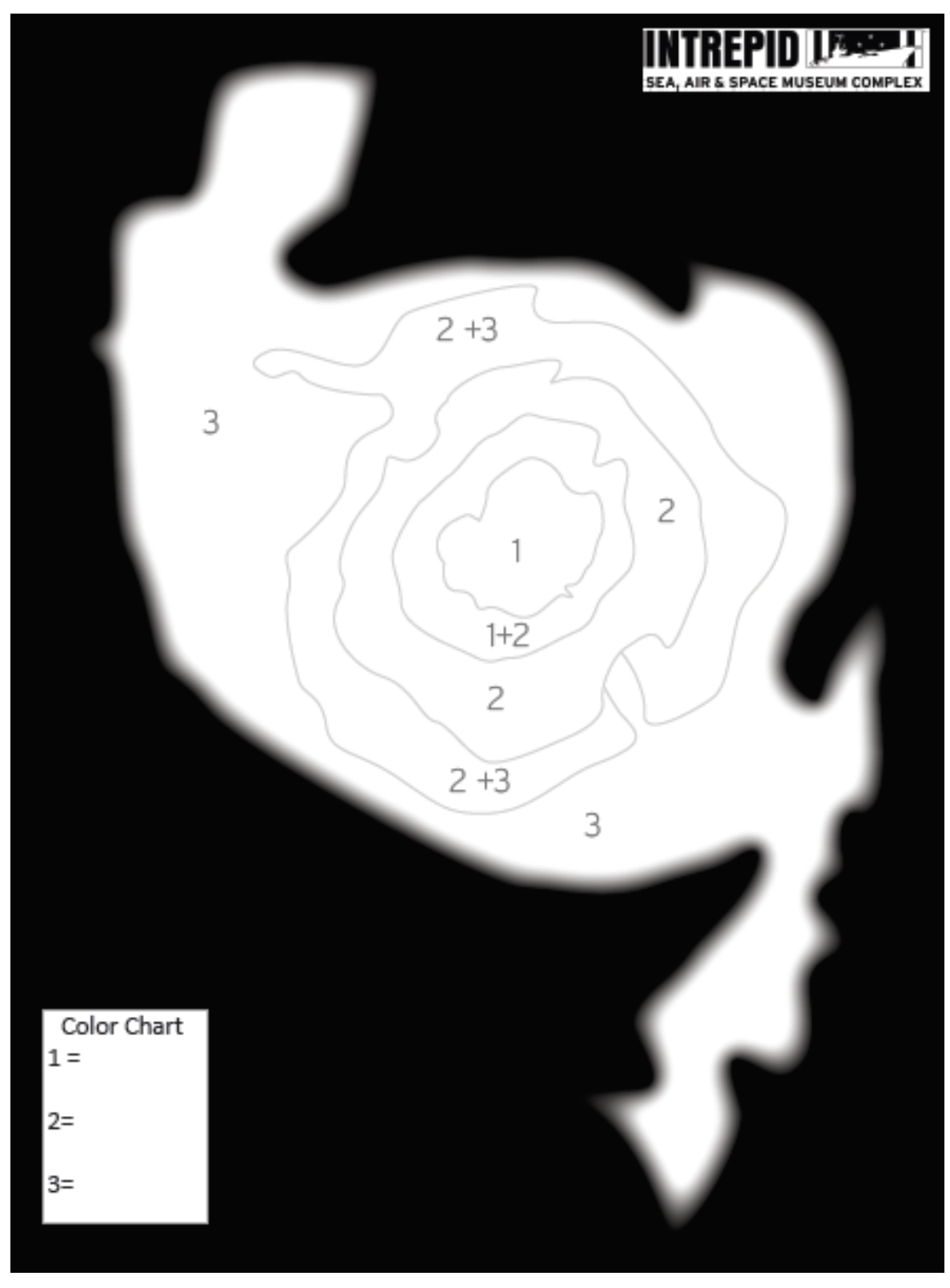
Planetary Nebula K 4-55